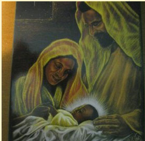
Feast of the Holy Family of Jesus, Mary and Joseph