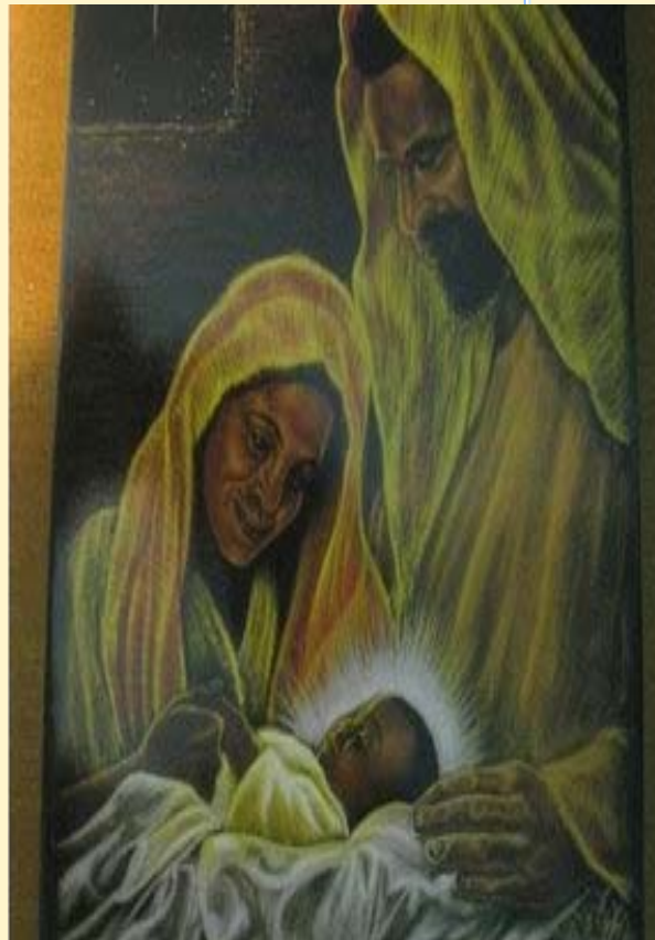
Feast of the Holy Family of Jesus, Mary, & Joseph