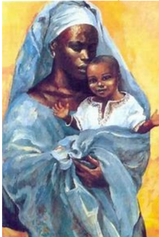
The Assumption of the Blessed Virgin Mary