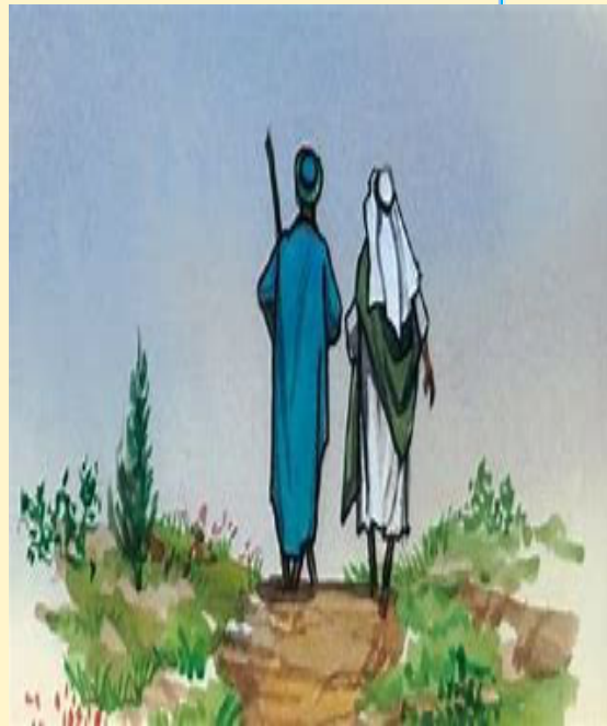
15th SUNDAY IN ORDINARY TIME

NEW PARISHIONERS: WELCOME TO OUR PARISH COMMUNITY! We ask that you please call the office to register in the parish.