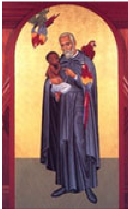
Feast of St. Peter Claver Patron Saint

We ask that you please call the office to register in the parish.