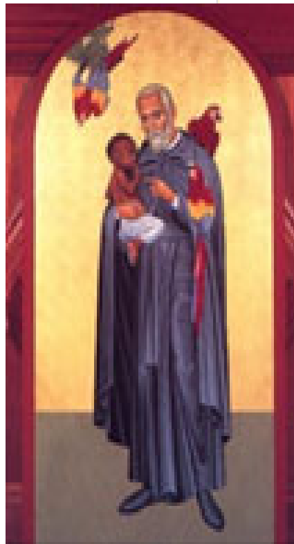
Feast of Peter Claver Patron Saint